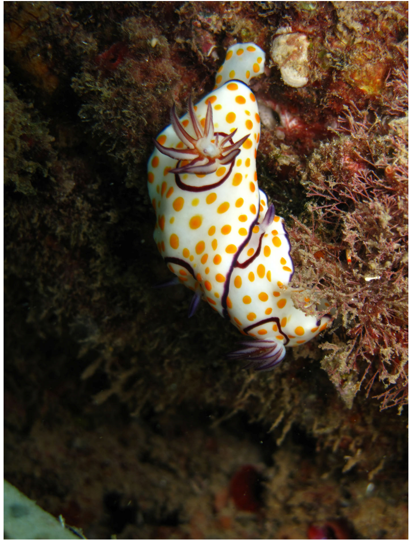
Figure 2. Chromodoris annulata Eliot, 1904. Photographed in Laboratory, specimen collected off Sedot Yam (TAU MO 73092) (Photograph by Oz Rittner).