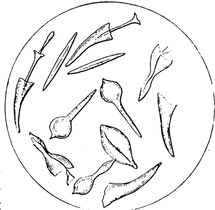
FIG. 1 shows the outlines of spicula subjected to the heat of the blow-pipe.

In order to test the character of spicula under heat, I submitted a piece of robust but rather immature sponge to the flame of a spirit lamp, which soon charred the contents of the spiculum and rendered it opaque, but left the outer silicious coat transparent. In many cases the internal tubular membrane was more conspicuous than before. Spicula from the same sponge were heated almost to fusion by the blow-pipe, giving results altogether unlooked for.